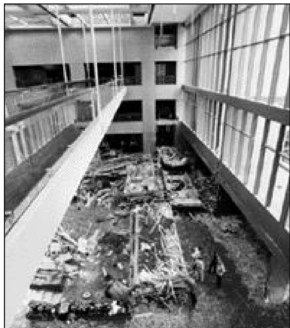
Figure 2: Hyatt Regency Walkway, Kansas 12