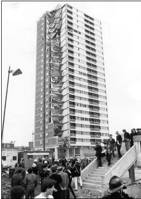
Figure 4: Ronan Point 14

Obviously the elements are varied to meet the needs of the specific cases. One ongoing area of work on the project is determining what elements to include in case studies.