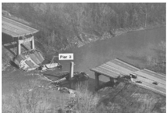
Figure 6: Schoharie Creek Bridge 16