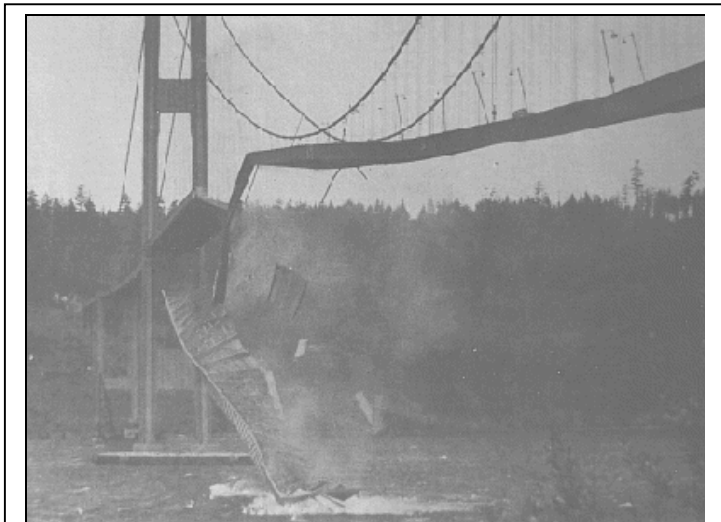
Figure 1: Tacoma Narrows Bridge 9

Although a lot of failure information is available, much of it has not been written in a format suitable for engineering educators. Fortunately, the author has been able to use undergraduate research assistants during the summer supported by the National Science Foundation through the UAB Research Experiences for Undergraduates (REU) Site in Structural Engineering since 1999. Each year, the students publish their cases on the UAB REU web site 8 . So far, two of the cases have been published in the ASCE Journal of Performance of Constructed Facilities 10, 11 and a third has been accepted for publication by the journal.