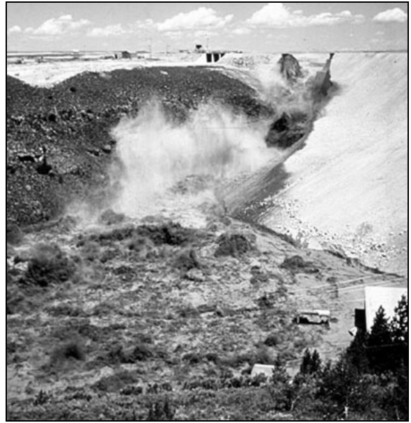
Figure 5: Teton Dam 15

Based on this earlier work, a more comprehensive master plan was published in 2000 4 . The plan was developed further, adding more topics and cases, and the revised version was published in 2002 1 .