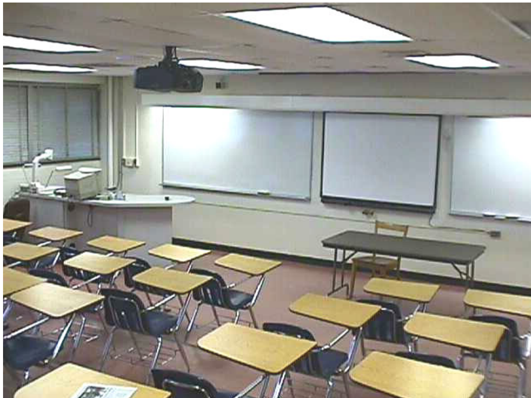
Figure 1. Classroom after modifications

The SmartBoard came with SmartNotebook software, which allows the SmartBoard to serve as a virtual whiteboard.. The user writes on the white screen using the electronic markers as if writing on a white board. A menu click saves the image and inserts a new page, but thumbnails along the side of the screen allow the user to return to any previous page. Images can be scanned and included in pages of a notebook, and pieces of text from one page can be copied and pasted to another. All the pages in a notebook can be saved as a web-based slide show. Figure 2 shows a sample screen from a Statics problem solution, including a scanned image and colored annotations.