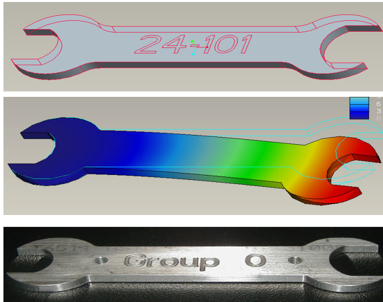
Figure 2: Sequence of modeling, analysis, and manufacturing steps involved in completing the CAE wrench tutorials.

beam bending equations. From the start, students are introduced to the concept of checking numerical results using “back of the envelope” calculations. The exercise is completed by some 220 freshmen students each academic year. Feedback demonstrates that students’ changes in their perception of mechanical engineering as brought on by the this project have had a significant and favorable impact on their decision to choose mechanical engineering as a major.