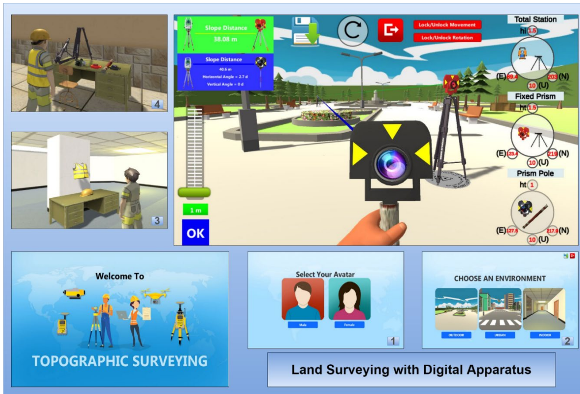
Figure 2. A Web-based gamification approach to topographic land surveying.