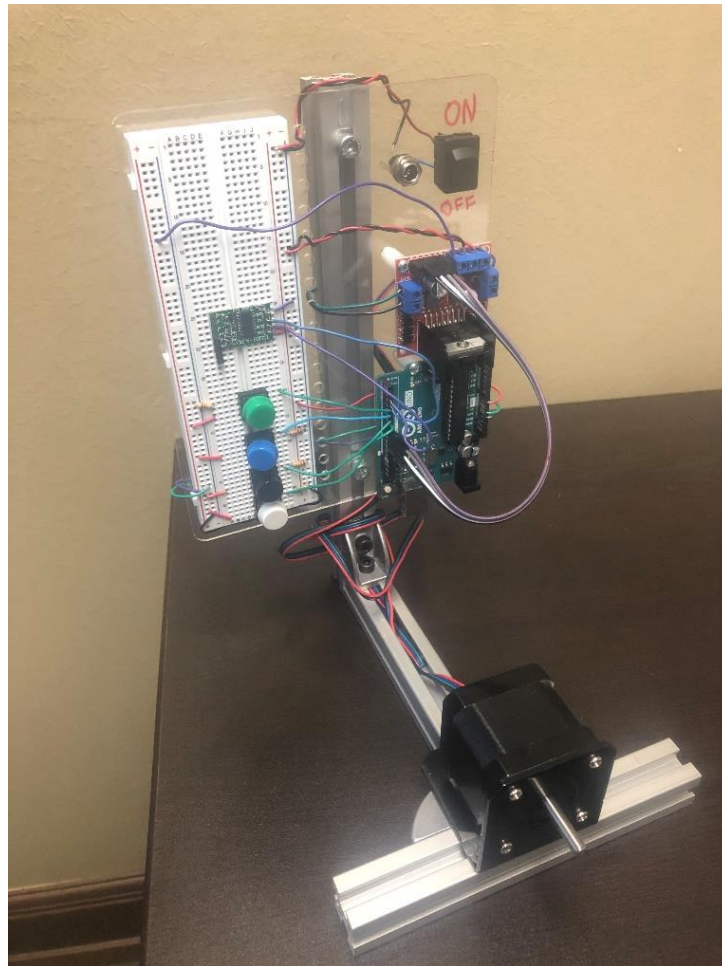
Figure 1. Individual Kit Assembly

The goal of these individual kits is to ensure that each student learns to control their own stepper motor before joining with a teammate. The first few homework assignments involve the students acquiring their kit and assembling the pieces with assistance from instructions on how to join the aluminum extrusions as well as circuit diagrams for properly wiring the motor, motor driver, and tactile buttons. After assembly, each homework is dedicated to learning to use the motor with increasing control. Initially, the students simply use a code that they can adjust between each upload to run the motor each direction and at various speeds. The students then develop a code that uses the tactile buttons to turn the motor in each direction. In the next assignment, the students create different “modes” for the motor. In “Jog Mode,” pressing one button (Button A) causes the motor to turn quickly. In “Test Mode,” pressing Button A causes the motor to move more slowly. The other button (Button B) is used to toggle between Jog Mode and Test Mode.