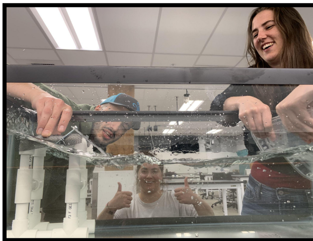
Figure 2. Undergraduate students participating in the wave energy summer CURE. Students are testing simple prototype ideas in a fish tank.

At the end of the class, students had created several functional prototypes for small-scale wave energy generation with the goal of reducing erosion and increasing oxygen levels in the water. At the end of the course we asked students to complete a survey based in part on the validated instrument by Corwin et al. [31]. Student survey responses were particularly positive for student research identity experiences. A summary of key findings from the survey is below.