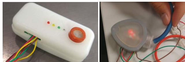
Figure 3: Two examples of complete student-built breathalyzers; the one on the right is demonstrating detection of breath alcohol above the legal limit.

This project has been run twice thus far: in 2014, with 44 students, and in 2015, with 35 students. Each year, all groups were able to make a working sensing circuit, capable of discriminating between different alcohol concentrations, as well as an appropriate case. Examples of student work are shown in figures 1-3; figure 1 demonstrates student mastery of Pugh concept selection, and figure 2 shows a size-minimized PCB layout.