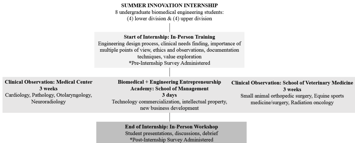
Figure 1. Summer Innovation Internship Program Overview. Participating clinical departments, in-person workshop topics, and survey administration timeline specified.

The internship began with a two-day workshop focused on needs-finding, needs statement development, conducting observations, ethics in observations, value exploration and design thinking. Over the course of seven weeks, students were immersed in full-time clinical observations at both the medical center and school of veterinary medicine. Each intern underwent 3 weeks of clinical observations at each clinical site, with a minimum of seven days in any one clinical department. Participating clinical departments are indicated in Figure 1. Interns were required to document their clinical observations in a physical notebook and provide weekly summaries of observations in a shared Google drive document. Virtual group meetings were also held weekly for a discussion and debrief session. In addition to clinical observations, students participated in a Biomedical + Engineering Entrepreneurship Academy (BMEA) hosted by our institution's institute for innovation and entrepreneurship, housed in the School of Management. The BMEA serves as a catalyst for idea translation, and integrates various teaching modalities including lectures, group exercises, and individual projects to aid participants in identifying, designing and validating market opportunities for their research and ideas. At the conclusion of the seven week internship, each intern presented their observations along with supporting clinical and market research for one identified unmet need.