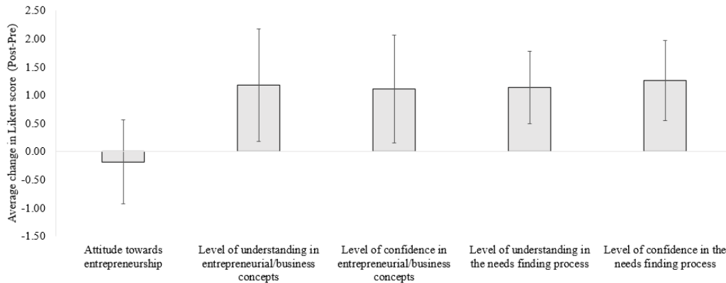
Figure 3. Average change (post-pre) in Likert scores across all participants for each theme. Error bars represent +/- standard deviation.